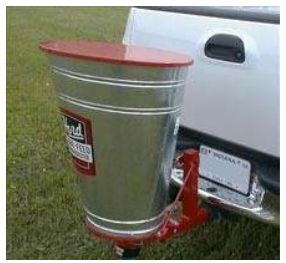
Shown with optional 2" receiver hitch

Instructions for Assembly, Mounting, Broadcasting, Operating, and Maintenance.