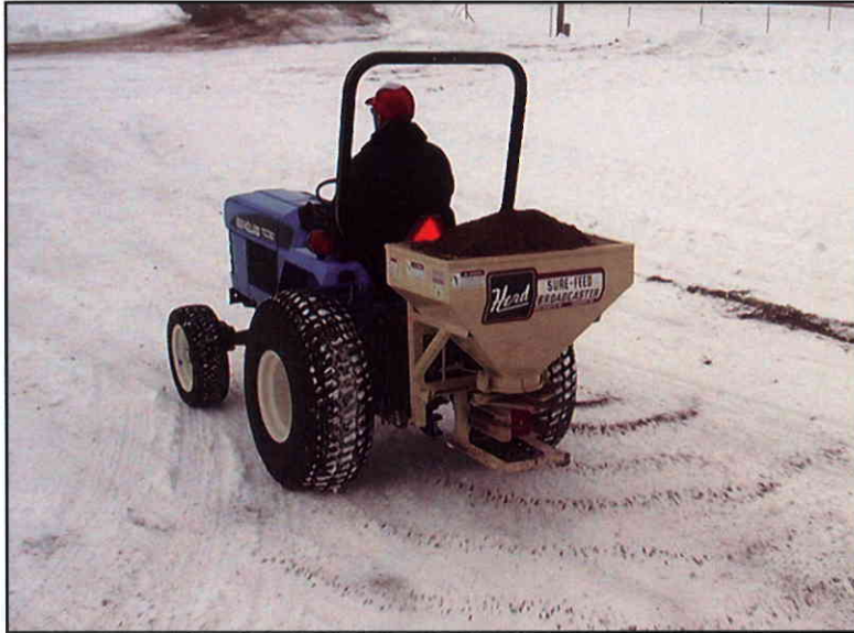
Shown above: Model 5.5

Herd can spread WET sand stored OUTSIDE and sand mixed with salt or calcium chloride.