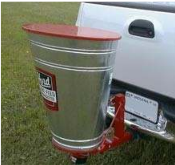
Shown with optional 2" receiver hitch

Instructions for Assembly, Mounting, Broadcasting, Operating, and Maintenance.